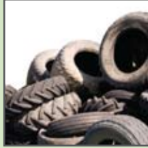
Tires * limit 5 per visit