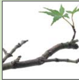
Limbs less than 5 feet in length