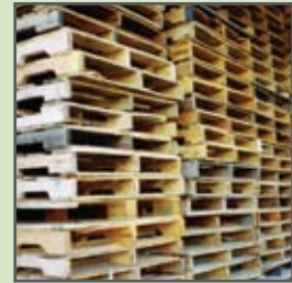
Pallets; unpainted & untreated