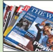
Paper, Newspaper & Magazines