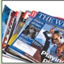
Magazines & Junk Mail