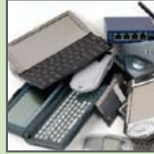
Electronics and Computers * limit 2 per visit