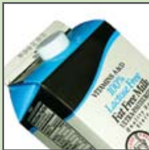
Wax Paper Cartons