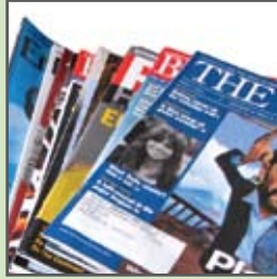
Magazines and Junkmail