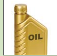
Motor Oil, Antifreeze & Oil Filters * limit 5 gallons