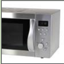
Appliances * limit 4 per visit