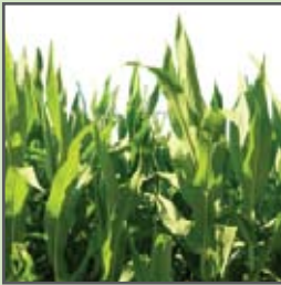
Leaves, brush & Grass Clippings