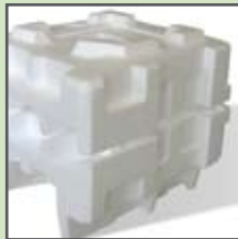
Styrofoam of any kind